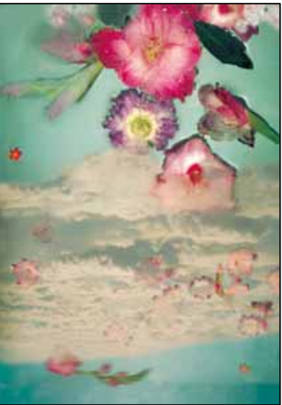
Floating World H1015mm x W745mm Title: Size: