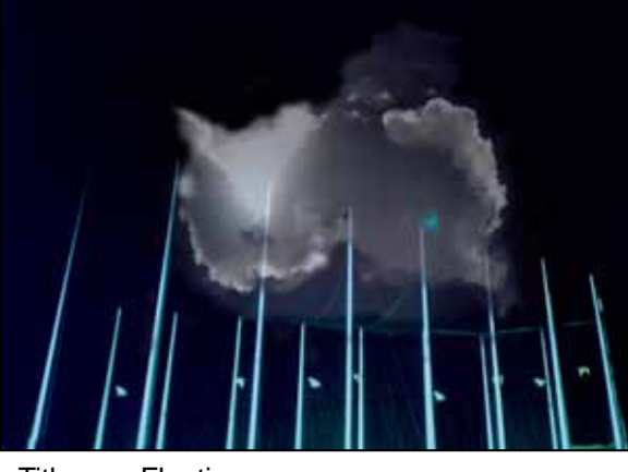
Title: Floating H722mm x W1000mm Size: